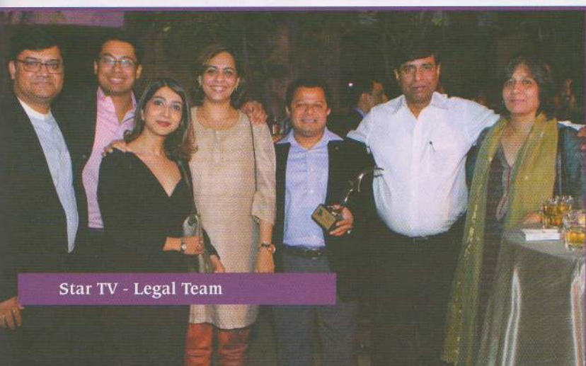
Star TV - Legal Team