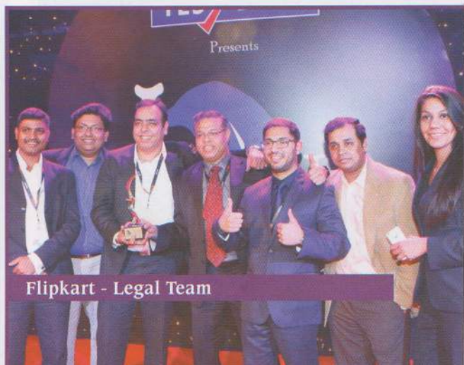
Flipkart - Legal Team